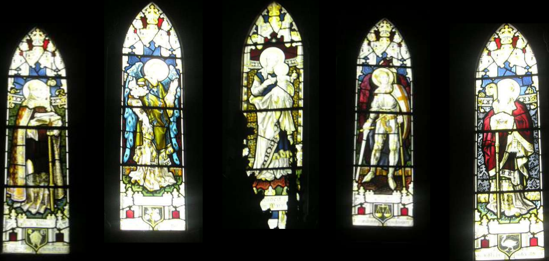
The Five Windows in the Apse, over the Lady Chapel