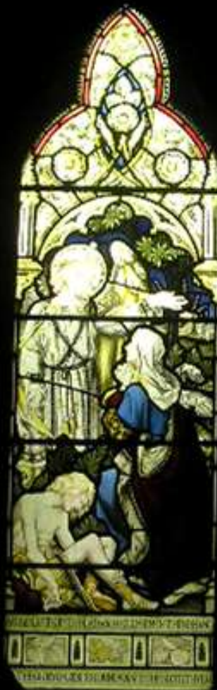
Lay not a hand upon the lad