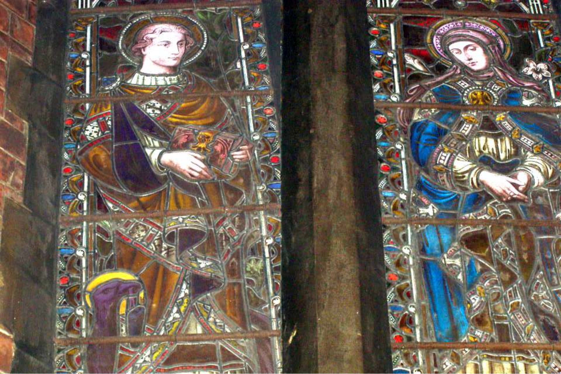
On the North Wall between Nave and Choir Vestry